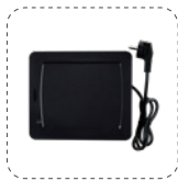
AM-D886: AM Deactivator