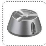
EAS-D10N: Universal Detacher 10000GS