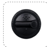
AMtag5 Spider Tag Detection Distance: 1.7-2.0m