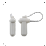
AMtag4 Tag with Lanyard Detection Distance: 1.2-1.5m