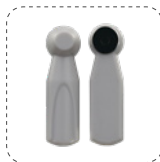
AMtag2 Small Pencil Detection Distance: 1.4-1.7m