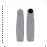
AMtag3 Big Flat Pencil Detection Distance: 1.9-2.2m